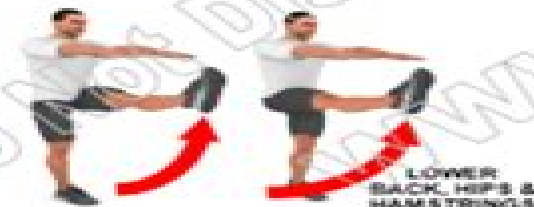
LOWER BACK, HIPs & HAMSTRINGS