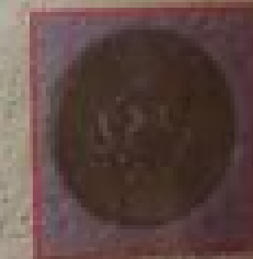
BACK OF BACK