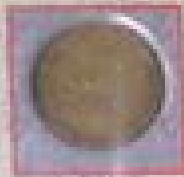
BACK OF BACK