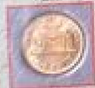
FRONT OF FRONT