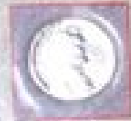
FRONT OF FRONT