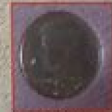
FRONT OF FRONT