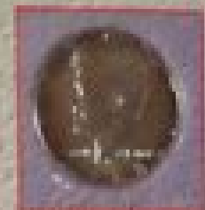
BACK OF BACK