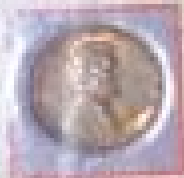
BACK OF BACK