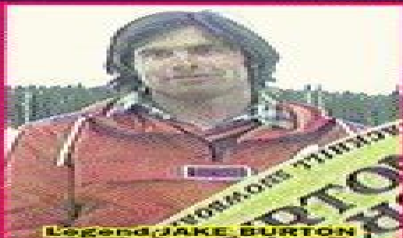
Legend JAKE BURTON