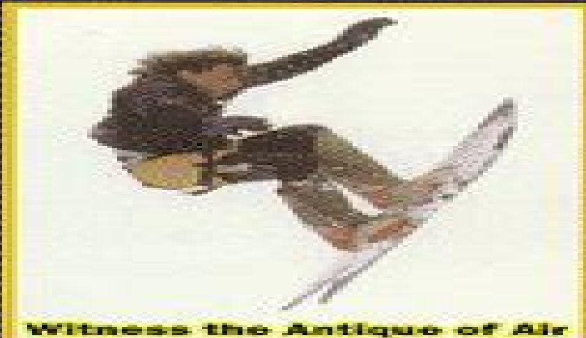
Witness the Antique of Air