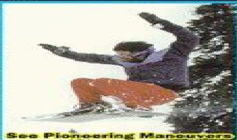
See Pioneering Maneuvers