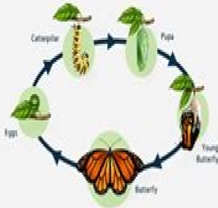
Butterfly Life Cycle

Holometabolous Life Cycle: Involves complete metamorphosis with distinct stages: egg, larva, pupa, and adult.