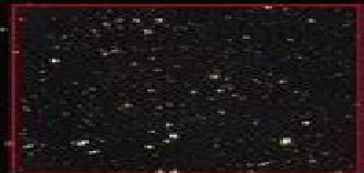
The Hubble Image of a small region of the observable universe.

The universe has both gravity and antigravity matters in 3-dimensional space!