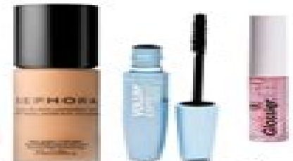
Makeup if u have any