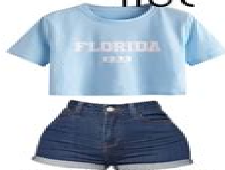
Tomorrow's clothes and a cute outfit for a photoshoot