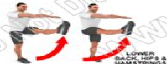
LOWER BACK, HIPs & HAMSTRINGS