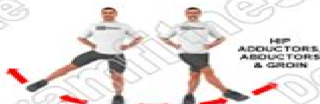
HIP ADDUCTORS, ABDUCTORS & GROIN