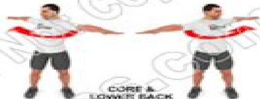
CORE & LOWER BACK