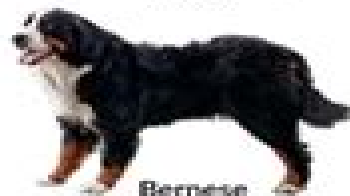
Bernese Mountain Dog