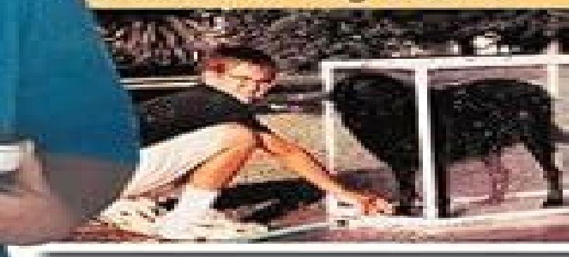
Automatic Dog Washer