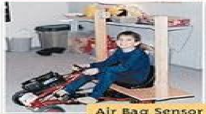
Air Bag Sensor