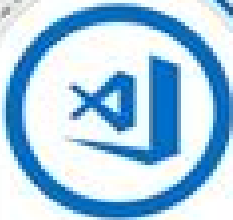
VS Code Tool