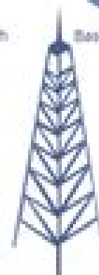
Wireless cell tower