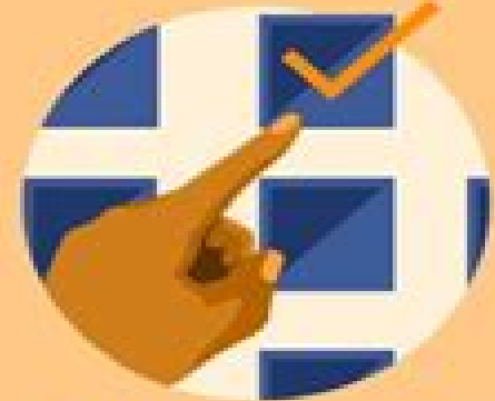
3. Gut instincts