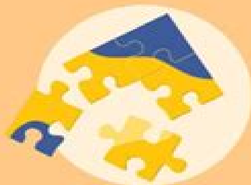
4. Working backwards