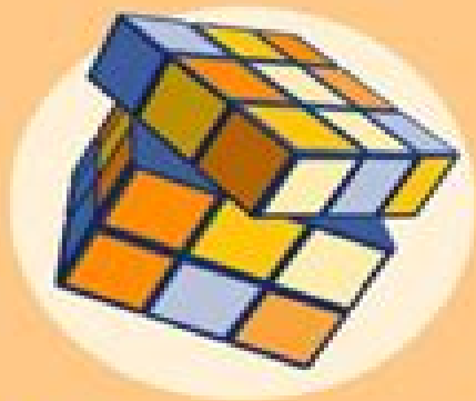
1. Trial and error