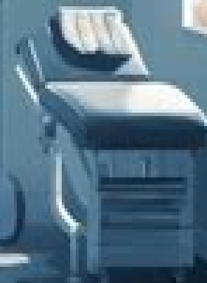
ILLUSTRATION BENEFITS CHIROPRACTIC CARE