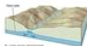
C Gaining stream (continued)