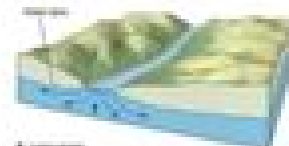
B Gaining stream