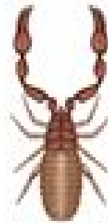
false scorpion (Pseudoscorpiones)