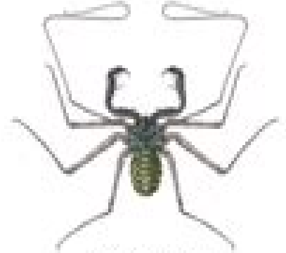
tailless whip scorpion (Amblypygi)