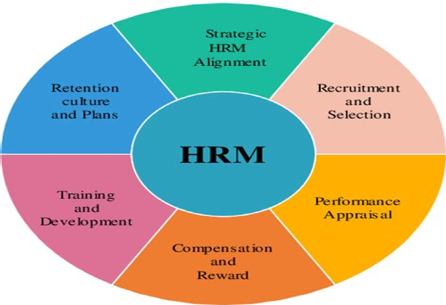
Figure 1. HRM practices