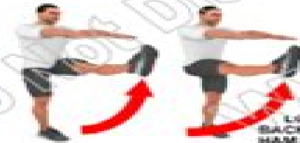
LOWER BACK, HIPS & HAMSTRINGS