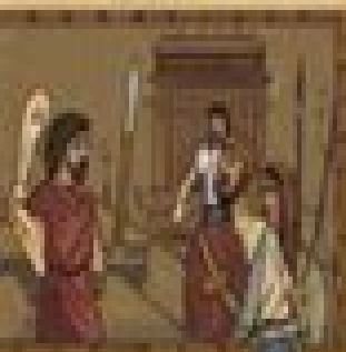
Flight into Egypt Matthew 2:13-15