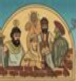
Three Kings Matthew 2:1-12