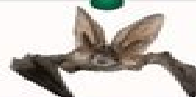
Kitti's Hog-Nosed Bat