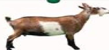
Nigerian Dwarf Goat