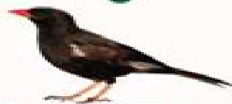
Red-billed Buffalo Weaver