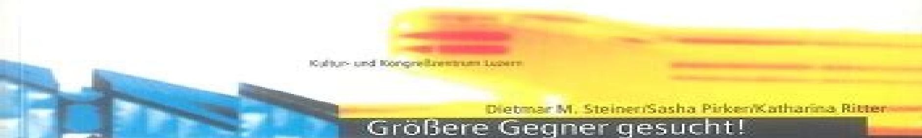
Kultur- und Kongresszentrum Lucerne