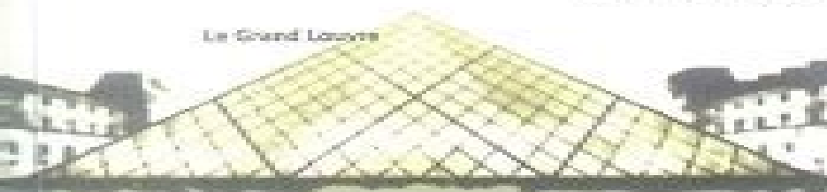
Le Grand Louvre