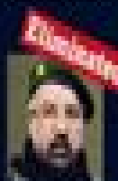
Fuad Shukur The highest-ranking military commander in the Hezbollah terrorist organization and head of the organization's strategic unit