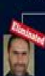
Wissam al-Tawil Commander of the Radwan Force