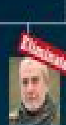
Mohammed Nasser Commander of the 'Aziz' unit