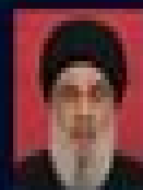
Hassan Nasrallah Secretary-General of Hezbollah