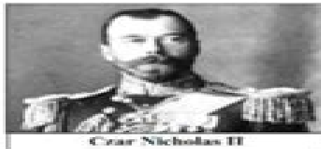
Czar Nicholas II

Until the beginning of the 20th Century, Russia was a large empire. The Russian name for their emperor was czar, and the czars had total power over their people. In the early 1900s, Czar Nicholas II and the Russian ruling class lived in great luxury. The Eastern Orthodox Church of Russia, the main religious organization, supported the Czar and the ruling class. The rest of the population lived in poverty under very harsh conditions. It was common for people to be without food.