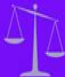
Justice and Injustice