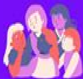
Friendship and Loyalty