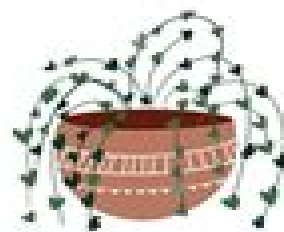
STRING OF HEARTS