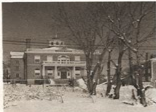
THE CUSTOM HOUSE (1819)

A CAMERA IMPRESSION BY SAMUEL CHAMBERLAIN