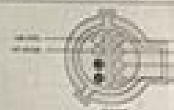
SPEED CONTROL, SERVO