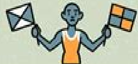
Inability to process social cues