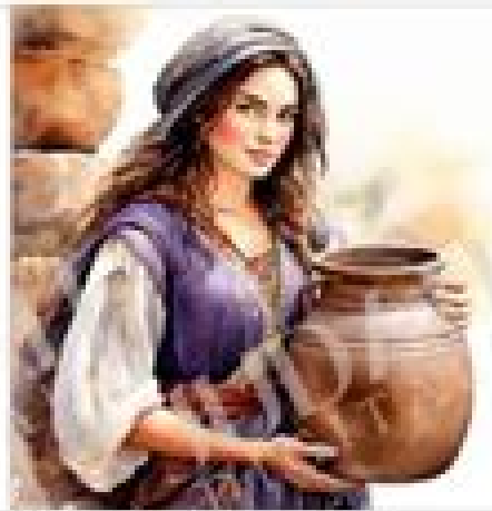
The Samaritan Woman