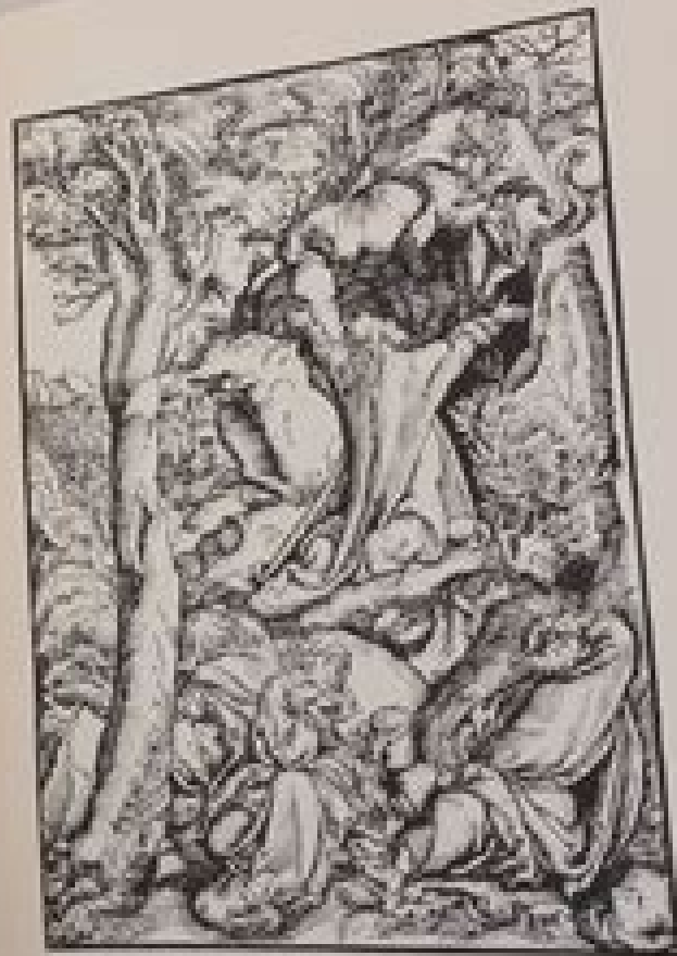
LEONARDO DA VINCI: THE GLASS (1495-1500)