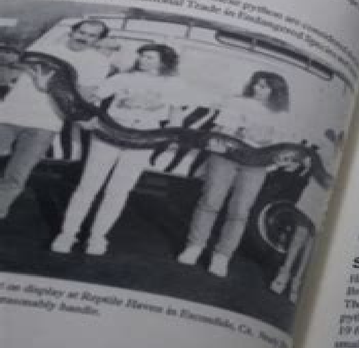
on display at Ripley Haven in Encinitas, Ca.

Burmese pythons and Java including the Burmese python are considered Appendix II pythons and Java including the Burmese python are considered Appendix I pythons on the International Trade in Endangered Species Convention.