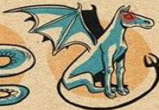
THE JERSEY DEVIL