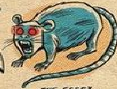
THE ESSEX PHANTOM