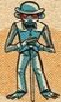
HOBOKEN MONKEY MAN