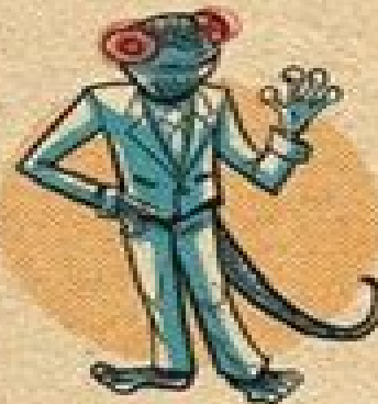
THE LIZARDMAN OF GREAT MEADOWS