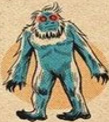
BIG RED EYE