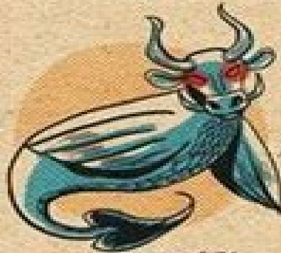
CAPE MAY SEA SERPENT