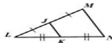
Use this figure for 1 - 7

In problems 8 - 9 use \triangle ABC , where D , E , and F are the midpoints of the sides.