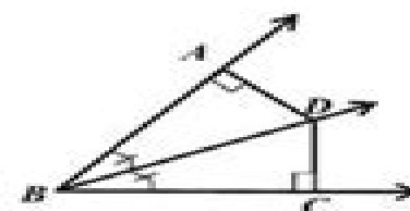
Use this figure for 10 - 13

In problems 14 - 16 use the diagram shown to find each measurement requested.