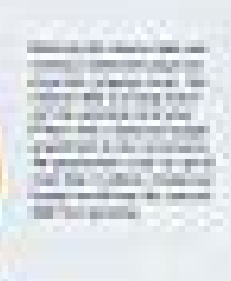
Legislative Branch Distribution

The Legislative branch is made up of Congress, which is divided into the House of Representatives and the Senate. Congress is responsible for making laws and controlling the budget. The House of Representatives is made up of members from each state, while the Senate has two members from each state.