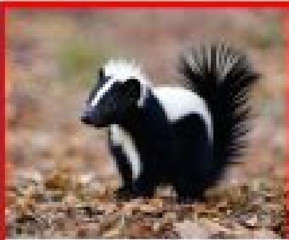
Skunk Life Cycle