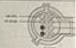
SPEED CONTROL SERVO