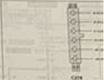
CLUTCH PEDAL POSITION (0V) (0V)