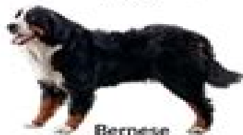
Bernese Mountain Dog