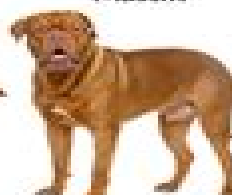
Dogue de Bordeaux