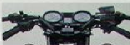
Independently adjustable handlebars designed for the rider's comfort and control. The Night Hawk's handlebars are custom designed for the rider's comfort and control.

story. This engine also has a reputation for reliability. The result of over a decade of building and testing four-cylinder engines. It features a maintenance-free transmission and ignition and its overall design makes it easy to work on.