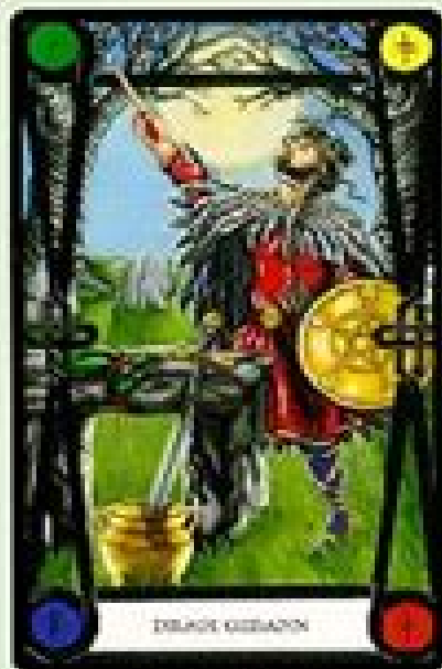
1- The Druid