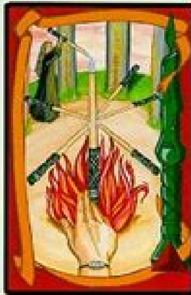
Seven of Time