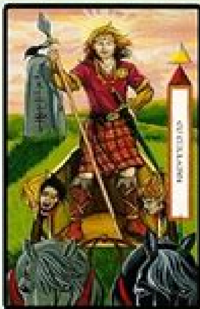
Ruler of Time