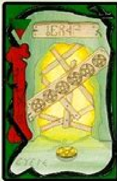
Seven of Domhan