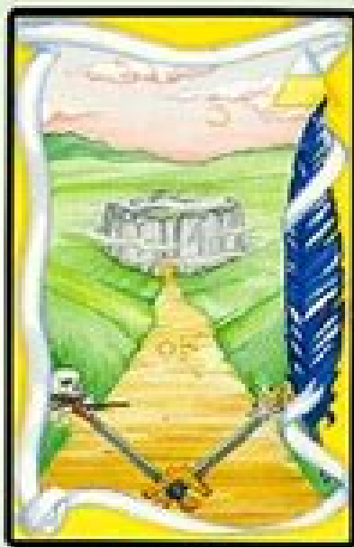
Two of Her