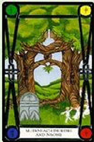
5- The Beloved