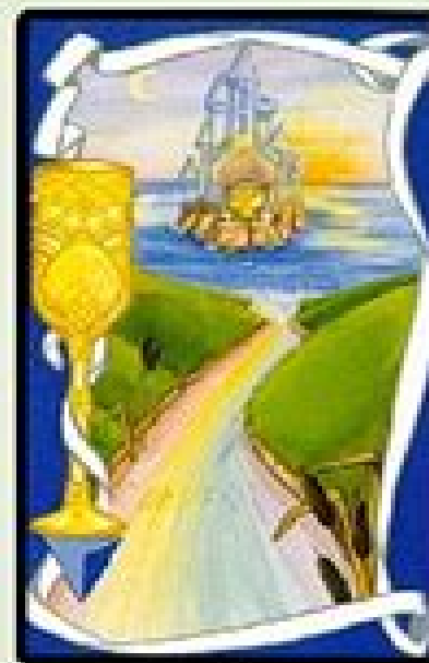
Ace of Utter