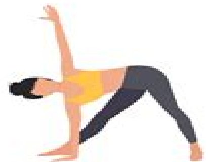
Triangle pose (Uttita Trikonasana)