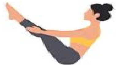
Boat Pose (Navasana)