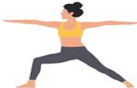
Warrior II (Virabhadrasana)