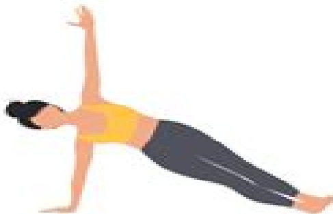
Side plank (Vasishthasana)