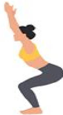
Chair pose (Utkatasana)