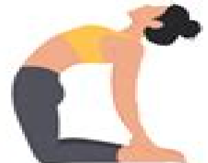
Camel pose (Ushtrasana)