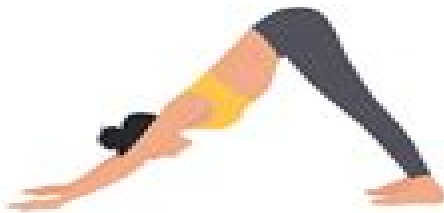
Downward Facing Dog (Adho Mukha Svanasana)