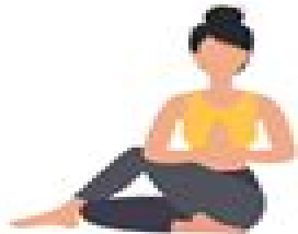
Half spine twist (Ardha Matsyendrasana)