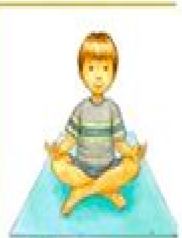
E Easy Pose