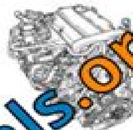
Fig. 1.22. General view of the engine Z 18 XEP

If it was decided to lift the engine, it is necessary to undertake certain