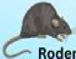
Rodentia (Rats, Squirrels)