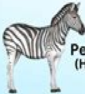
Perissodactyla (Horses, rhinos)