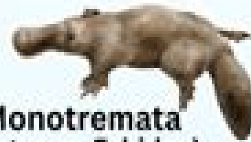
Monotremata (Platypus, Echidna)