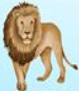
Carnivora (Cats, Dogs, Bears)

Mammals are warm-blooded vertebrates that have four limbs and hair and produce milk.