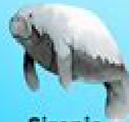
Sirenia (Manatees, Dugongs)