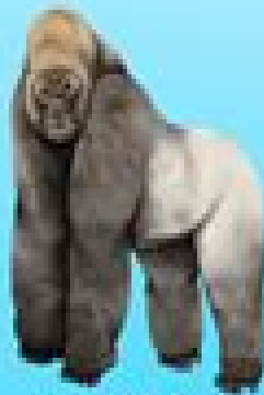
Primates (Humans, Apes, Monkeys)