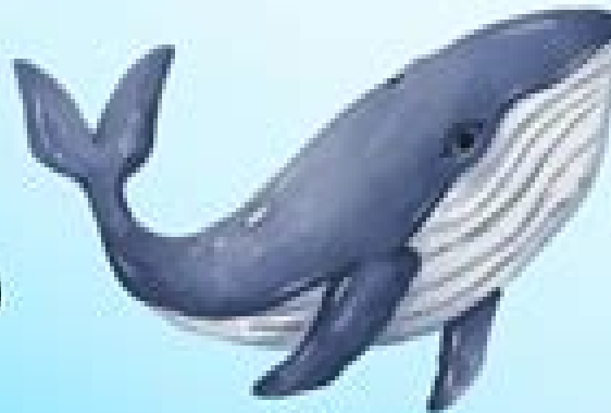
Cetacea (Whales, Porpoises)