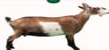
Nigerian Dwarf Goat