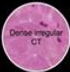
Dense irregular CT