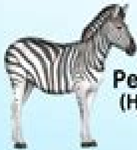
Perissodactyla (Horses, rhinos)