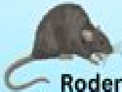
Rodentia (Rats, Squirrels)