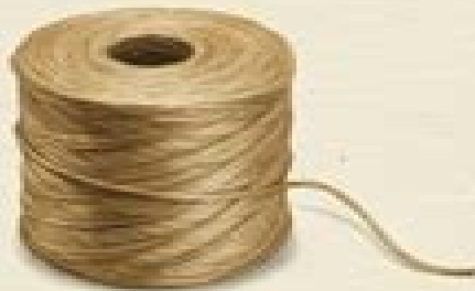
Fakrakong askugntial aydlering indihurs esed-tunpuslin