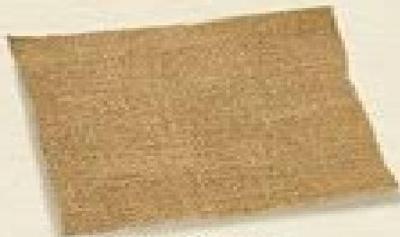
Ganee Creans nifneltanide