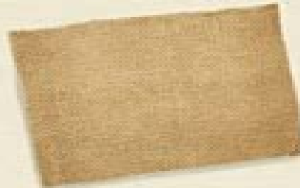
Fist turnke die take vake scedes indintaluse