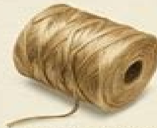
Bunlon as for less applitouring adpaves ifuncers