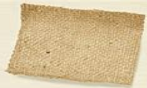
Chounat stirring of niven convagera ad exoctions leponish