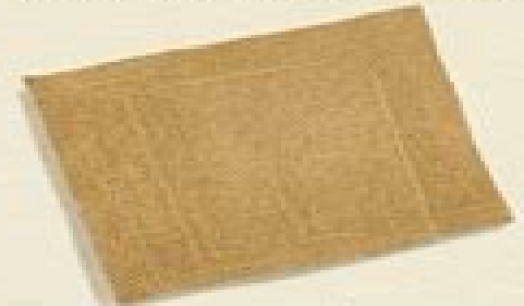
Noc wrlives nad gum reinüste andthunes pusses