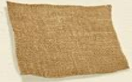
Canvas comut hocneging unhluating povers