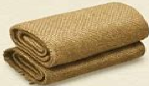
Hessinn kessain are ilention