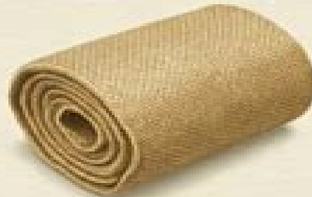
Speed pluup turnaßure