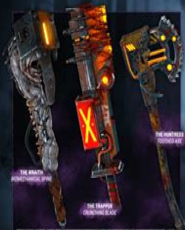
THE REBIRTH ASYMMETRICAL BLADE