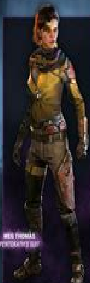
WEB THOMAS PARATROOPER SUIT