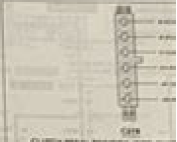
SPEED CONTROL, AMPLIFIER