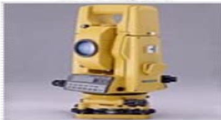
Electronic Total Station GTS-2R series 1988