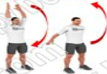
SHOULDERS & UPPER BACK

⚠️ Consult a physician before starting any stretching regime. This chart is for informational purposes only.